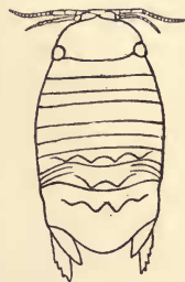
FIG. 3. — Sphæroma destructor . Dorsal view. \times 3 .

The first and fourth thoracic segments are of equal length and are one and a half times longer than the other thoracic segments. The epimeral parts are distinct from the segments, are quite broad, and terminate laterally in acute angles, which point downward. The seventh thoracic segment bears four tubercles situated in a transverse line.